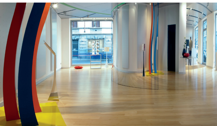
Allianz Tower, Milan (I), arch. A. Isozaki