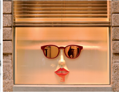
Excelsior, Milan (I), arch. Jean Nouvel