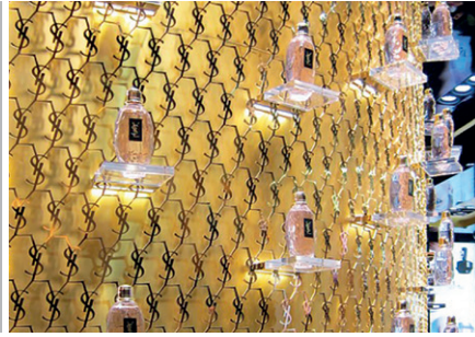
P.O.S. Yves Saint Laurent worldwide