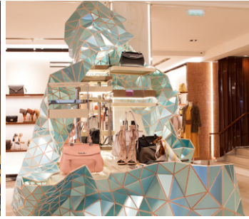
Longchamp store in Paris (F)