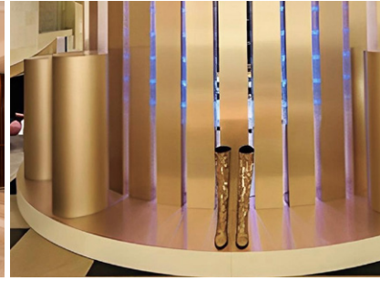
Louis Vuitton New Bond Street store (UK)