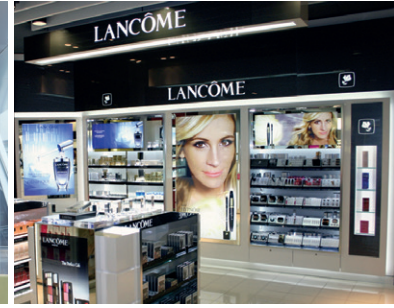
Lancôme corners, worldwide