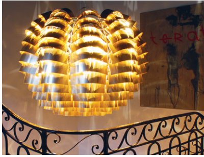
Luminaries in private house (F)