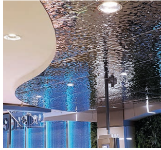
bxDECOR ceiling application